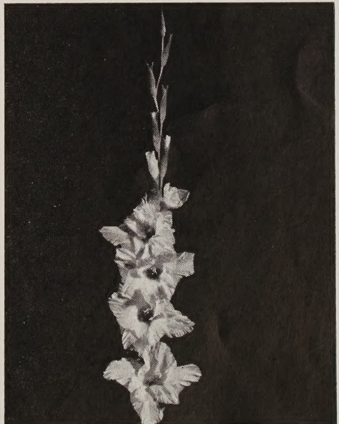
DISCOVERY (From a Small Bulb)